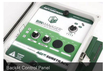
Backlit Control Panel