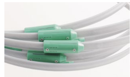
Moisture and Temperature Cable

Check your bin activity from anywhere at anytime