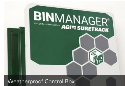
Weatherproof Control Box